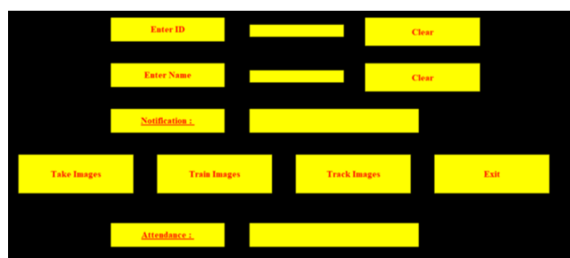
Fig. 1. Front page-

And in this system we can use also library for run a program. Library used are face-api.js ,Tensorflow.js and face landmark recognition web Api is used for feteching facial detection.