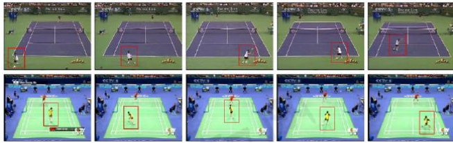
Fig 1: Object detection and tracking sample in Tennis and Badminton

To get the information of outline of the sports track Karumen-Loeve (KV) transform was applied. This is done after reduction background to map the information of outline into an Eigen-space. Then the eigen values are arranged in a descending order, with the Eigenvector of the first m biggest value to form apparent descriptors of action and gestures. Finally nearest neighbor classifier was used to recognize action sequence by according those description.