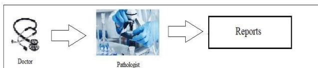
Figure 1. Traditional Stress Detection System