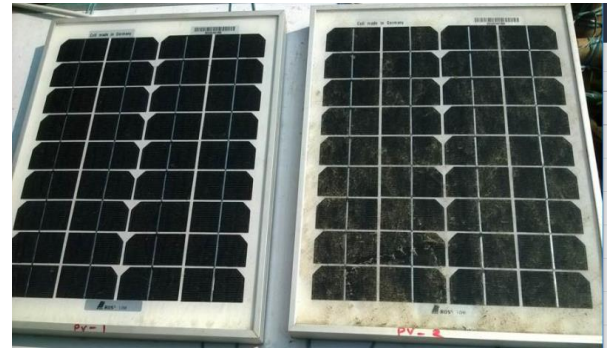
Fig 1: Two solar panels placed at open place exposed to sunlight, one is cleaned regularly (left one) and another one was kept without cleaning.