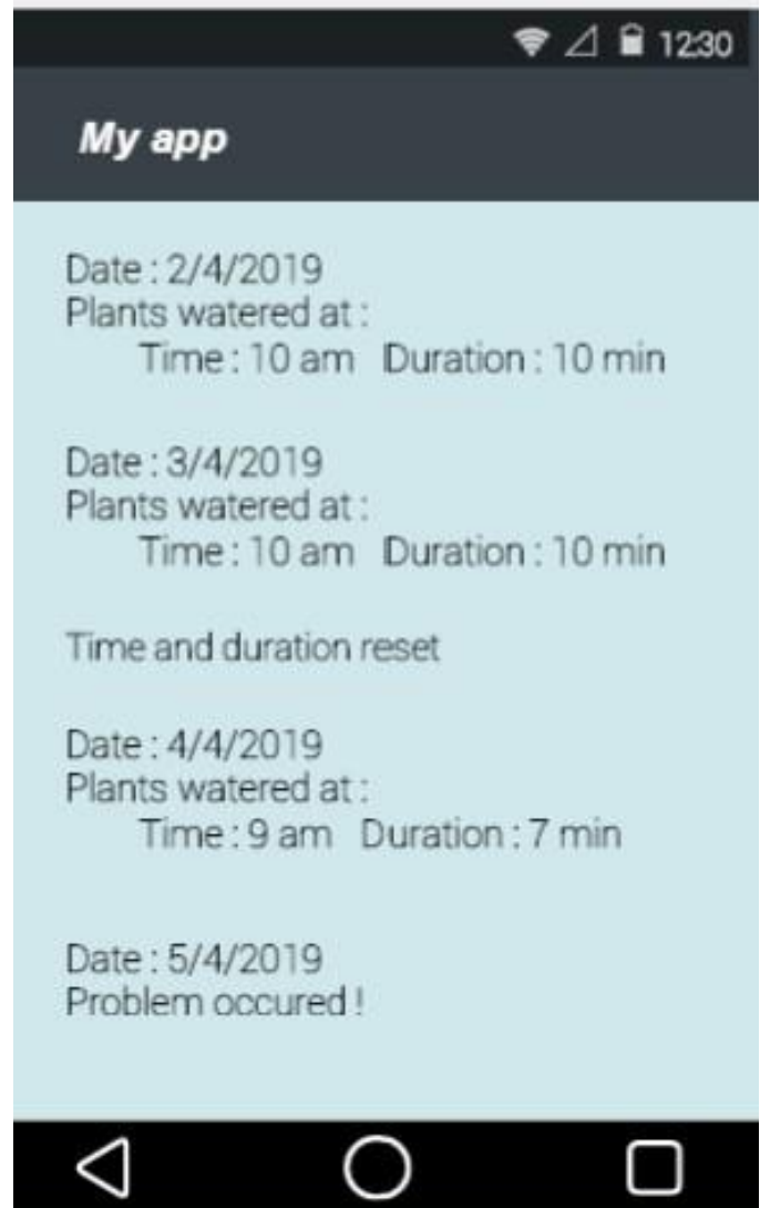
Fig. 4. Android application displaying the daily status of system which includes the day, date, time when plants are watered. Also showing notification during disruption

Real Time Plant Watering system enables users to set the time and duration for which he wants to water his plants. These details would be set by the user only at the time of initiation, thus reducing his manual efforts. Also, he can keep a track 24*7 as to when his plants are watered through android application on his phone. In case of disruption, he will be notified with a message on the application.