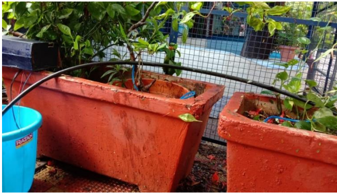
Fig. 1. Real Time Plant Watering system