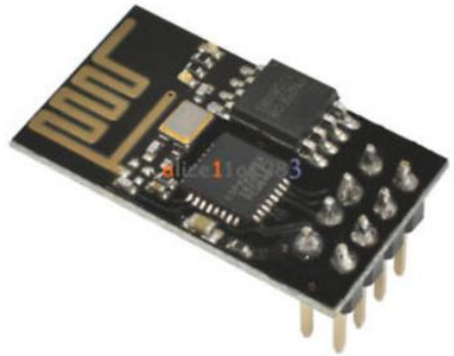
Figure 2 : ESP8266 module

For this experiment, four esp8266 were used. The devices contained an onboard 2.4GHz WiFi chip antenna. Hence, a simple WLAN could be created using said antennas by programming them to transmit and receive signals. Three nodes were configured to be the transmitters and one node was set to be the receiver. The receiver node was set up as a router, where it would broadcast a signal that the other nodes could use to connect to the WLAN and provide communication capabilities between the devices. Each of the transmitting nodes continuously polled their WiFi antenna, scanning for any available signals along with their measured RSSI values. The RSSI values would then be transmitted to the receiver along with the identity of the node that was sending the data. All received data would then be displayed on the terminal of the device. To record the measured RSSI values, a computer was connected to the network of the receiving node.