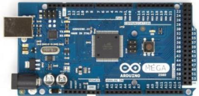
Figure 3: Arduino Mega